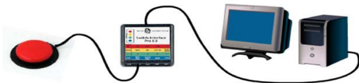
Switch switch interface computer

Computers and tablets do not usually have a port that enables you to plug switches directly into them. A switch interface is therefore required to use switches with a computer or tablet. The interface will enable the switches to replicate certain keyboard keystrokes to use software or apps. Different switch interfaces will be appropriate depending on the type of computer or tablet and the software being used. Switch interfaces can be wired (plugged in) or Bluetooth. The interface may have its own switches built in or external switches can be plugged into it.