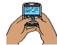
PCS and Boardmaker are trademarks of Tobii Dynavox LLC. All rights reserved. Used with permission